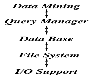
Figure 1: KDD Abstraction Layers

posited that around 80% of the KDD effort is spent in these steps, rather than mining). The picture gets even more complicated when one considers persistent data management of mined patterns and models.