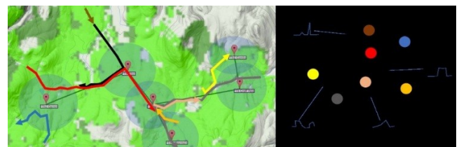
Figure 2: Modeling Information Exchange

Our framework measures capacity by means of an emergency smartphone app that supports the collection of information from different sources and its exchange among first responders, government agencies, and residents. We therefore assume that a community member within the range of a network will certainly exchange information through such app. The app collects individual mobility patterns, which may be affected by multiple factors (such as employment, friendship relationships, visits to local business, etc.) as well as Internet access (see Figure 2: on the left, there is a set of trajectories of community members and, on the right, there is an example of an opportunistic network among community members with connectivity profiles).