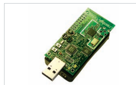
TPR2420 with Sensor Suite

Document Part Number: 6020-0094-01 Rev B